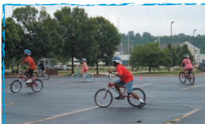
Kids practiced skills in the free ride area at the bike rodeo.

Over 1,000 area children can tell you how to stay safe while riding their bikes, thanks to Children's Hospital Advocacy staff. 217 children received free bike helmets, learned about traffic signs, and practiced bike riding skills at the three bicycle rodeos and one toddler tricycle rodeo held in June. Advocacy staff also visited 5 area schools and