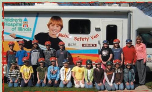
UNDERCOVER class in Tremont in front of the Mobile Safety Van

Irving Primary students got the chance to become "Risk Watchers" this year. Children's Hospital of Illinois and Irving Primary School in Peoria paired up to bring Risk Watch, an injury prevention curriculum developed by the National Fire Protection Association, to students in Kindergarten through 5th grade. Students learned how to watch for risks at home and at play. According to evaluations, Irving students increased their safety knowledge by 12%, soaring past the state average of 9%. Great Work!