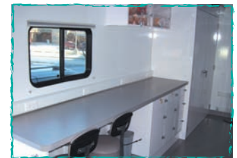
Workstation inside van.

To request a Mobile Safety Van appearance, please visit the Children's Hospital of Illinois's Advocacy Department website at www.childrenshospitalofil.org/top/families/advocacy_programs.htm , fill out the event request form, and fax it back to (309) 671-4832. The request will be reviewed, and you will be contacted promptly.