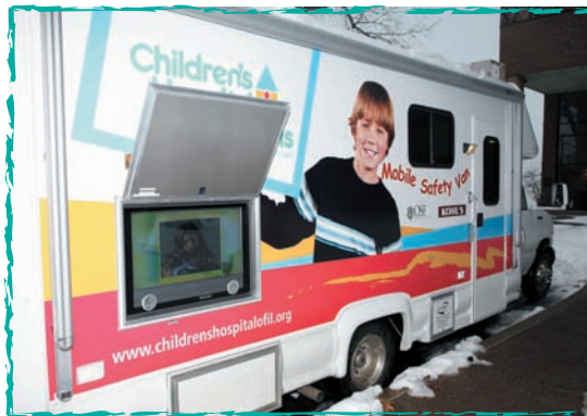
Exterior of Mobile Safety Van.

Through a grant from Kohl's and the generosity of the OSF Healthcare System employees, Children's Hospital of Illinois added a Mobile Safety Van to the ever-expanding list of safety education and injury prevention services offered to the community.